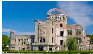
Atomic bomb dome (Hiroshima city)