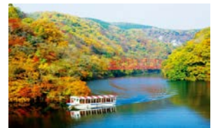
Taishakukyo (Shobara city)