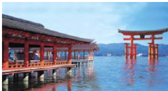
Miyajima (Hiroshima city)

Miyajima and the Atomic Bomb Dome, World Heritage sites, and many other historic buildings are located in Hiroshima. In addition, there are many sightseeing spots with an abundance of nature.