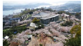
Senkoji temple (Onomichi city)